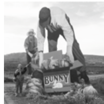
Samples of the "Larger the Life" billboards planned for Humboldt County Agriculture Commodities.

This program can be expanded beyond the newspaper to radio and other community newsletters. Look for this feature in the Eureka Reporter this summer.